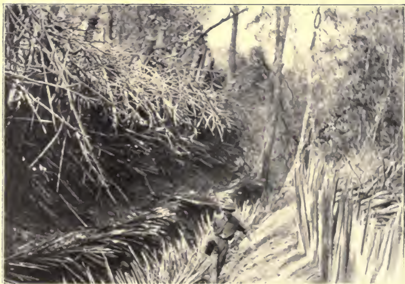
THE STOCKADE AND DITCH AT FORT BOWER.